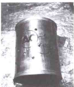
Original fuel filter and Housing, 1957

Also, the best method of cleaning or freeing up a cylinder is to use air pressure and oil and by repeating pressure at the top and bottom working the shaft up and down this should remedy the problem.