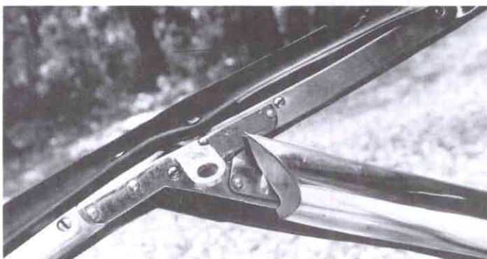
Fig. 1 — Filler Plates

It's just another one of those little things that other people might not consider that important, but I made sure that my 1957 'Vette had them both.