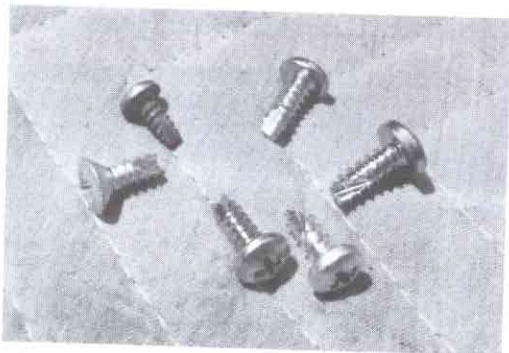
All screws used in Corvette to hold various items were slotted. Any questions?