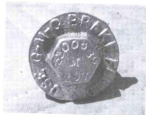
Master brake cap 5300880, Cast Iron '53-'61