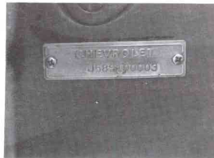
Figure 4. The serial plate installed on 1958 serial number 3.