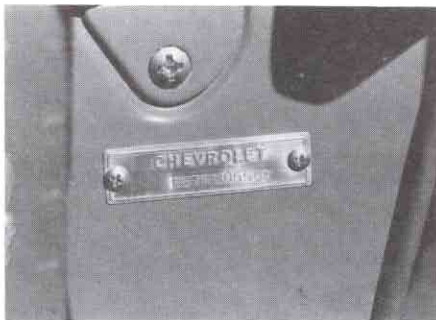
Figure 3. The installation of a serial plate on the front door post of 1957 serial number 5,586.