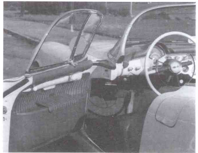
Figure 2. The 1953 to 1955 serial plate location, shown here on a 1953 Corvette.