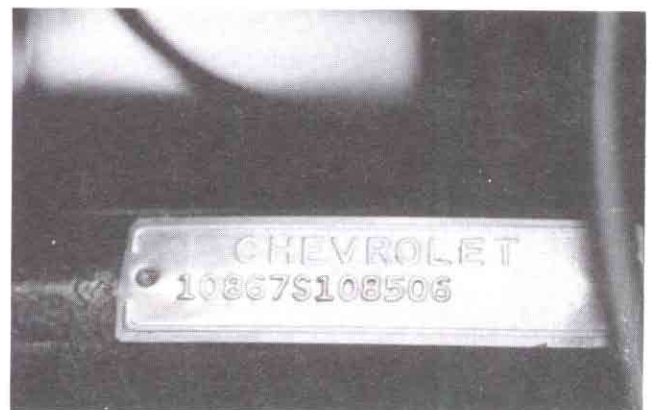
Figure 7. The serial number plate installed on 1961 serial number 8,506.